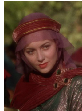
Olivia de Havilland as Maid Marian

Some recent adaptations of the Robin Hood myth also portray her as tomboyish and a skilled fighter.